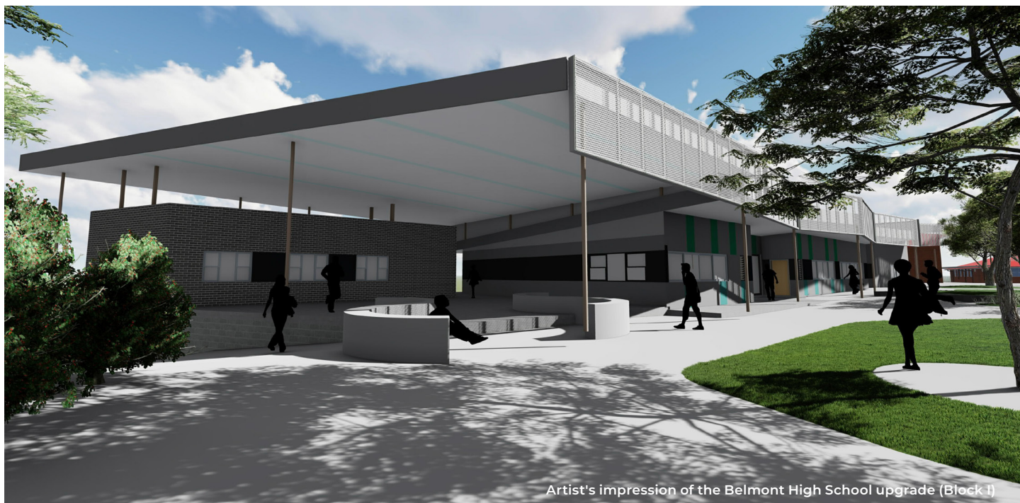
Artist's impression of the Belmont High School upgrade (Block I)