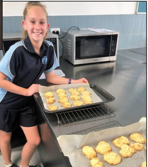
KIDS in the KITCHEN